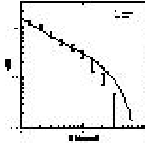
Fig. 1. The SDSS early galaxy data angular 2-point correlation function (filled circles), within the magnitude interval 18 < r^* < 19 . (This plot is Fig. 1 in Connolly et al. 2002). It is compared with the correlation function from the APM (Maddox et al. 1990) measured over the magnitude interval 18 < B_j < 20 (solid line). The SDSS correlation function has been scaled to the depth of the APM data using Limber's equation.

The main result is that \omega(\theta) is a power-law with an exponent of \approx -0.7 over 2 orders of magnitude, from scales between 1 arcmin to 0.5 degree. There appears to be a break in the power-law at scales 1 - 2 degrees. At \theta < 1' , the fit is not consistent with a power-law.